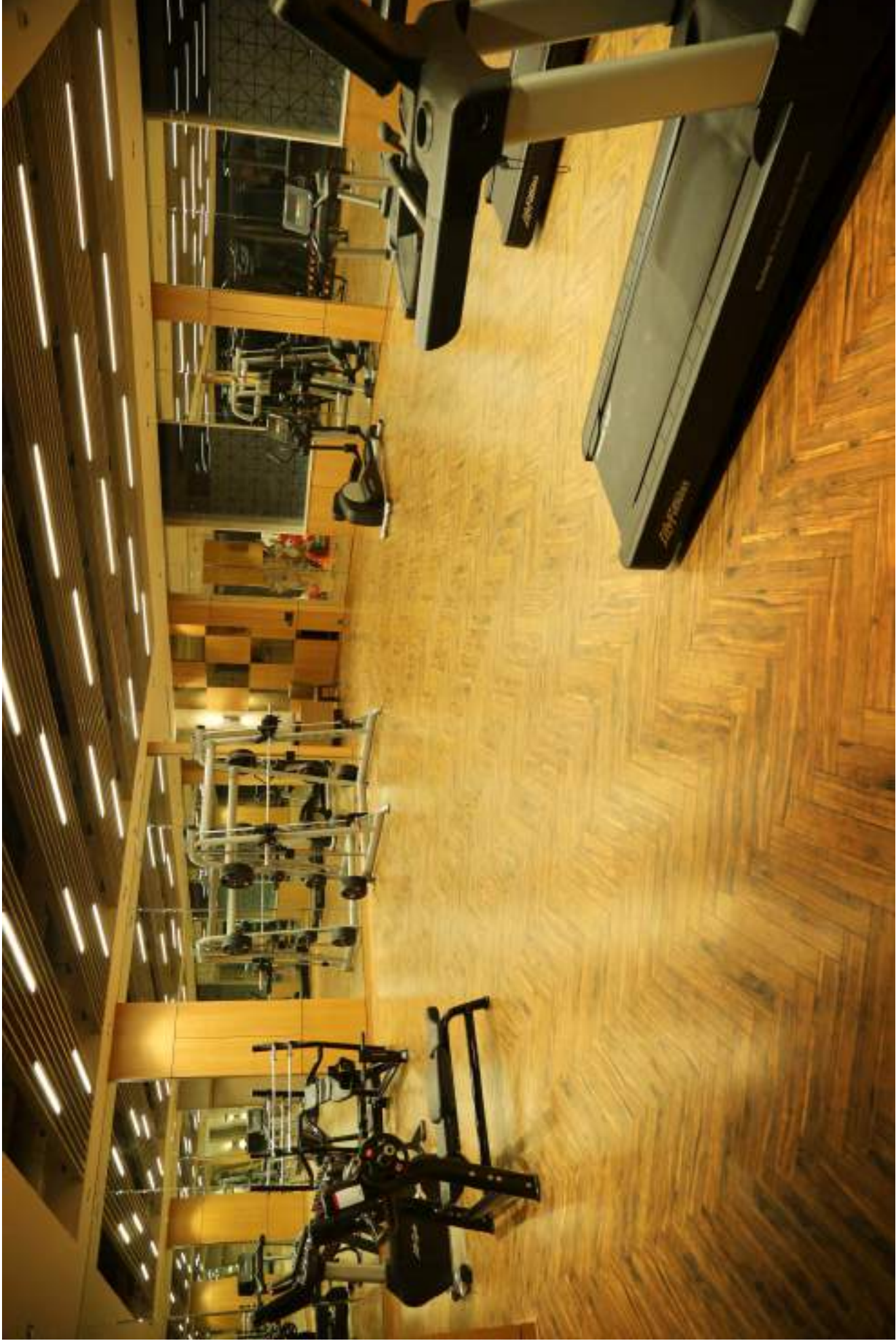
GYM at Pocket B Club