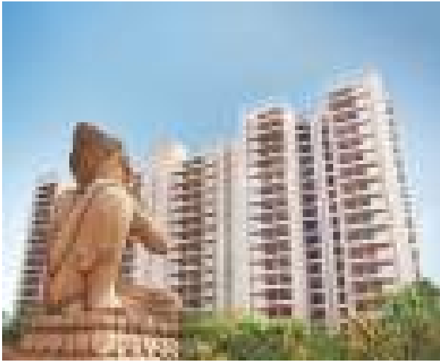
THE PRANAYAM, FARIDABAD