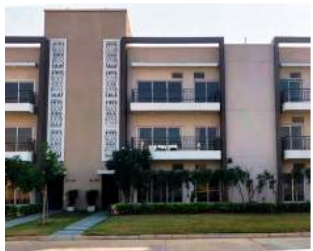
AMANVILAS LUXURY FLOORS, FARIDABAD