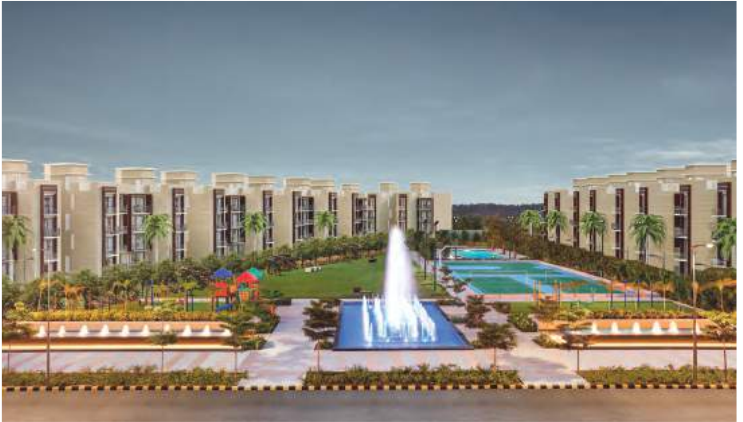
LUXURIA FLOORS AT AMANVILAS, FARIDABAD