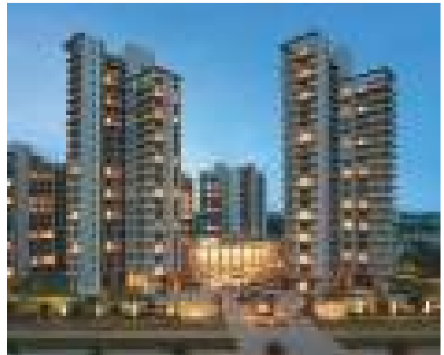
DIPLOMATIC GREENS, GURGAON