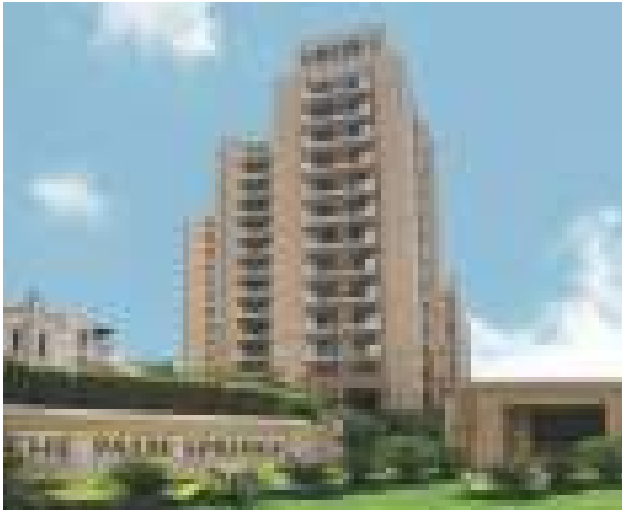
THE PALM SPRINGS, GURGAON