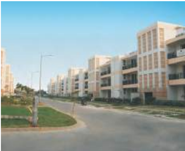
V.I.P FLOORS, FARIDABAD