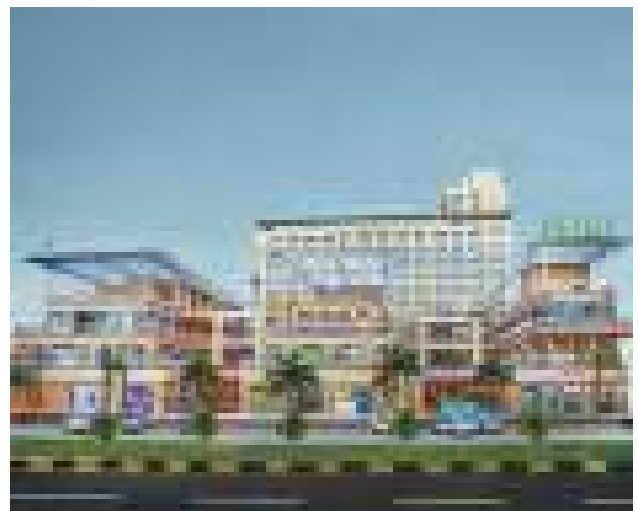
81 HIGHSTREET, FARIDABAD