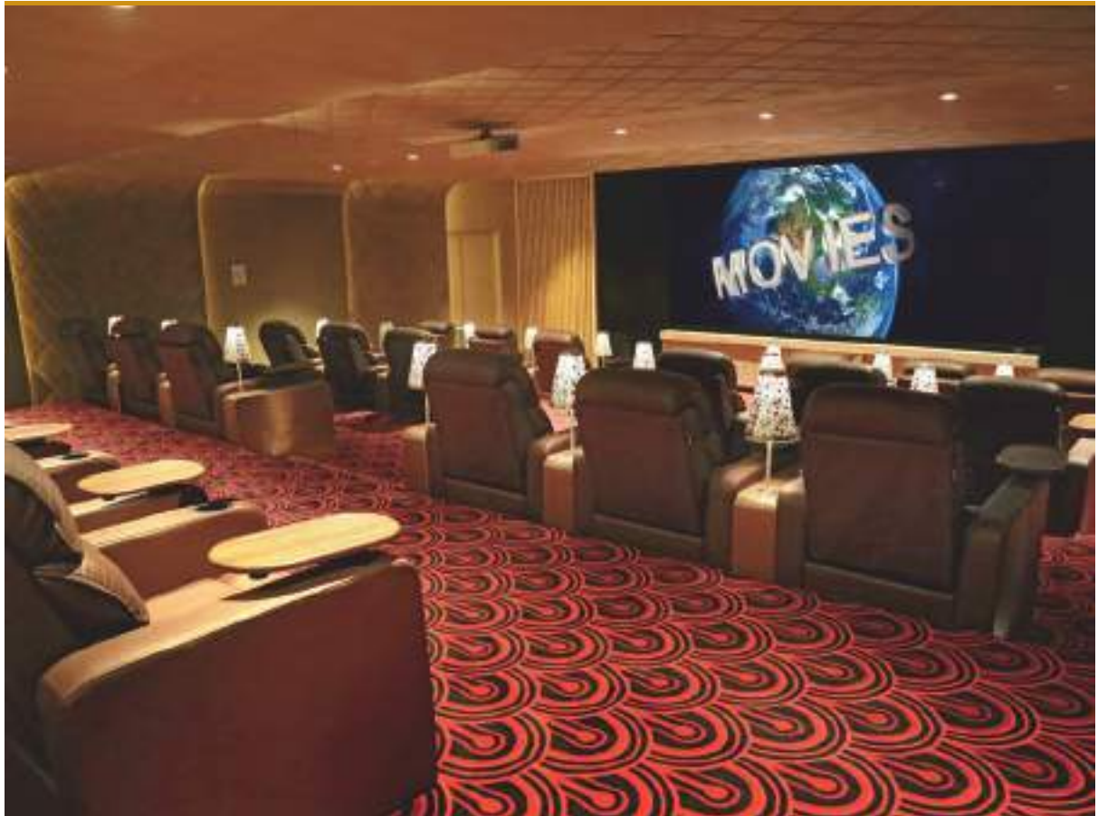
ACTUAL IMAGE OF MOVIE THEATRE