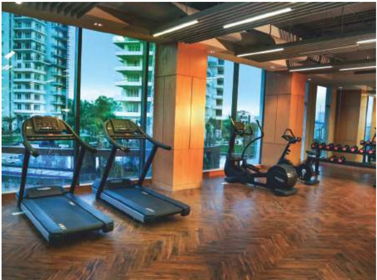
ACTUAL IMAGE OF GYMNASIUM