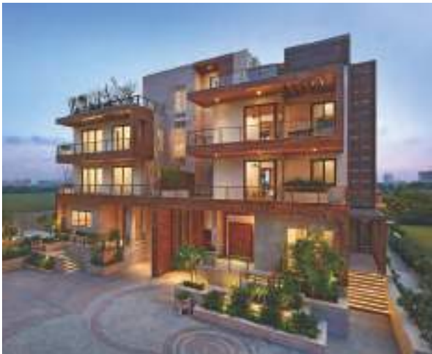
VILLAS AT DIPLOMATIC GREENS, GURGAON