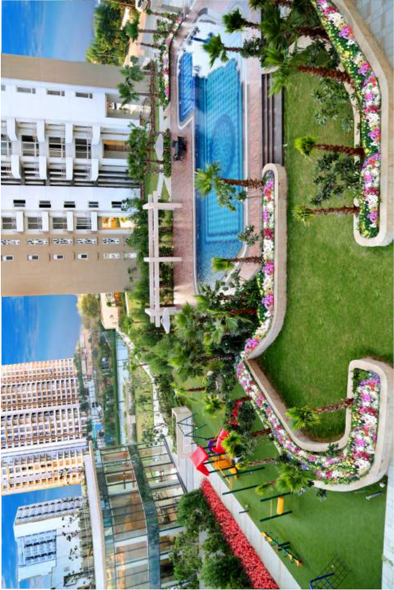
Pool & Kids Play