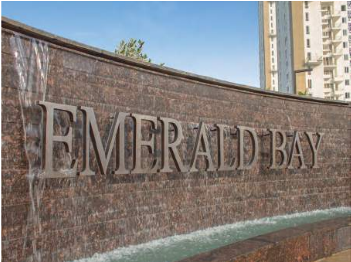
ACTUAL PICTURES OF EMERALD BAY, GURGAON