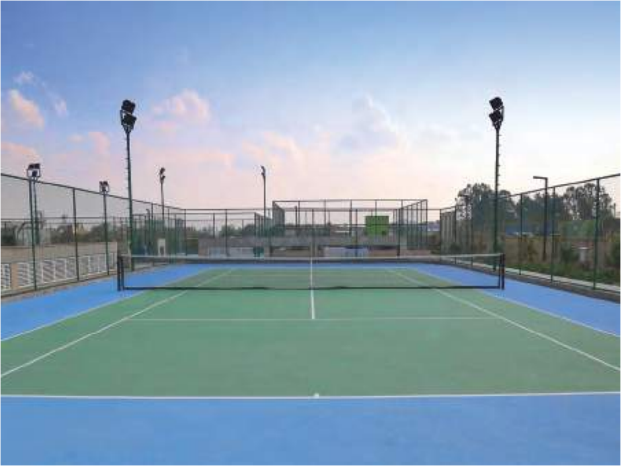
ACTUAL IMAGE OF TENNIS COURT