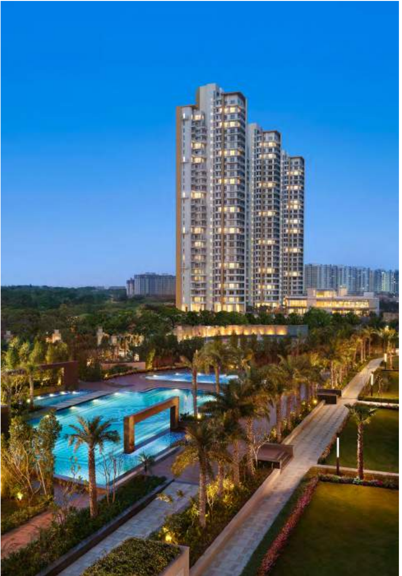
ACTUAL PICTURES OF EMERALD BAY, GURGAON