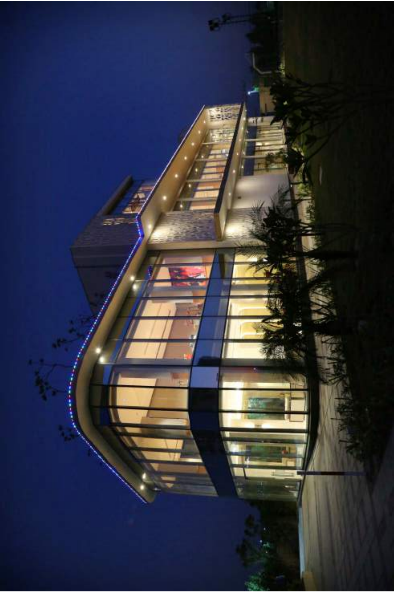
Actual Image of Pocket B Club