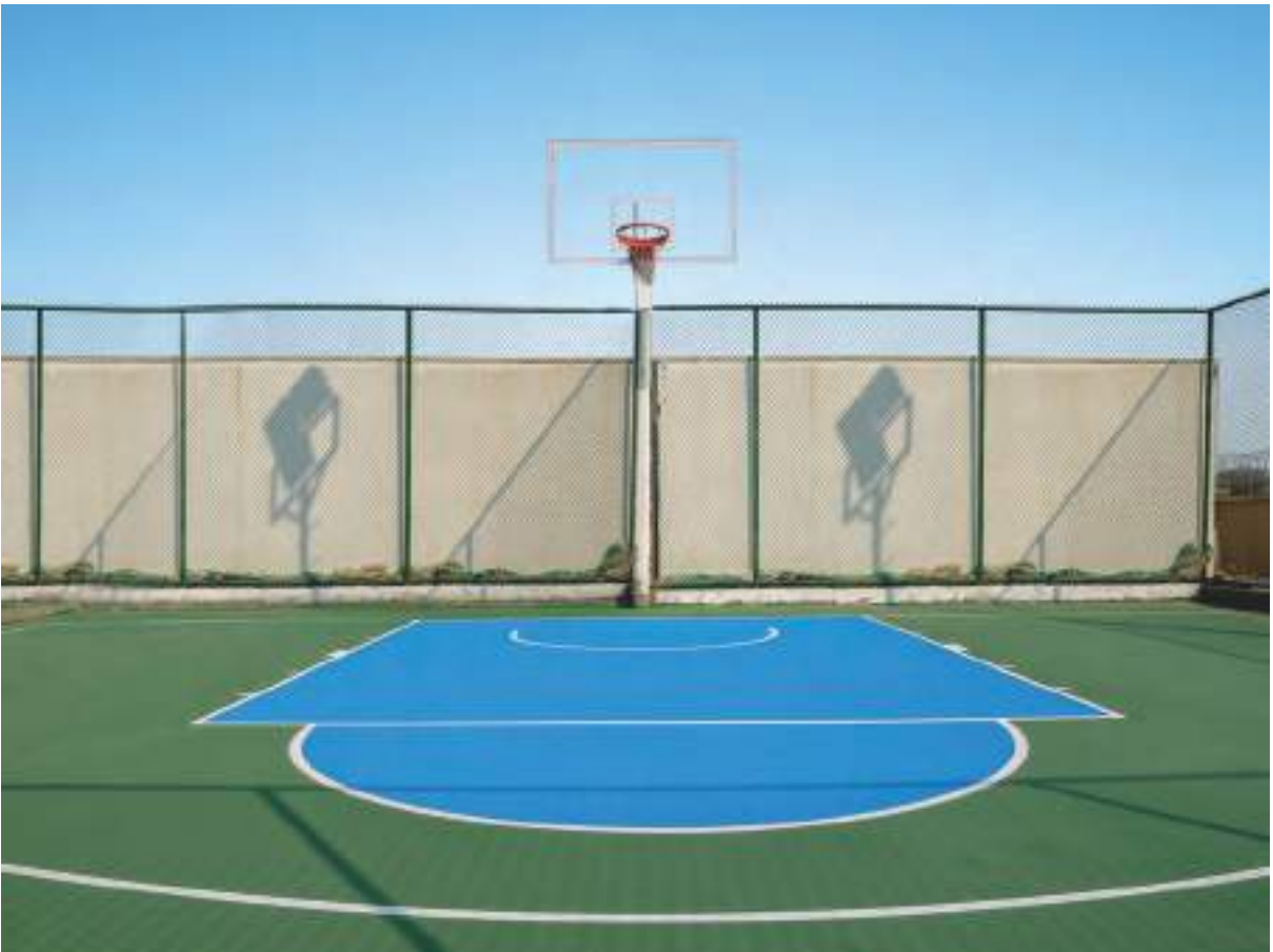
ACTUAL IMAGE OF BASKET BALL COURT