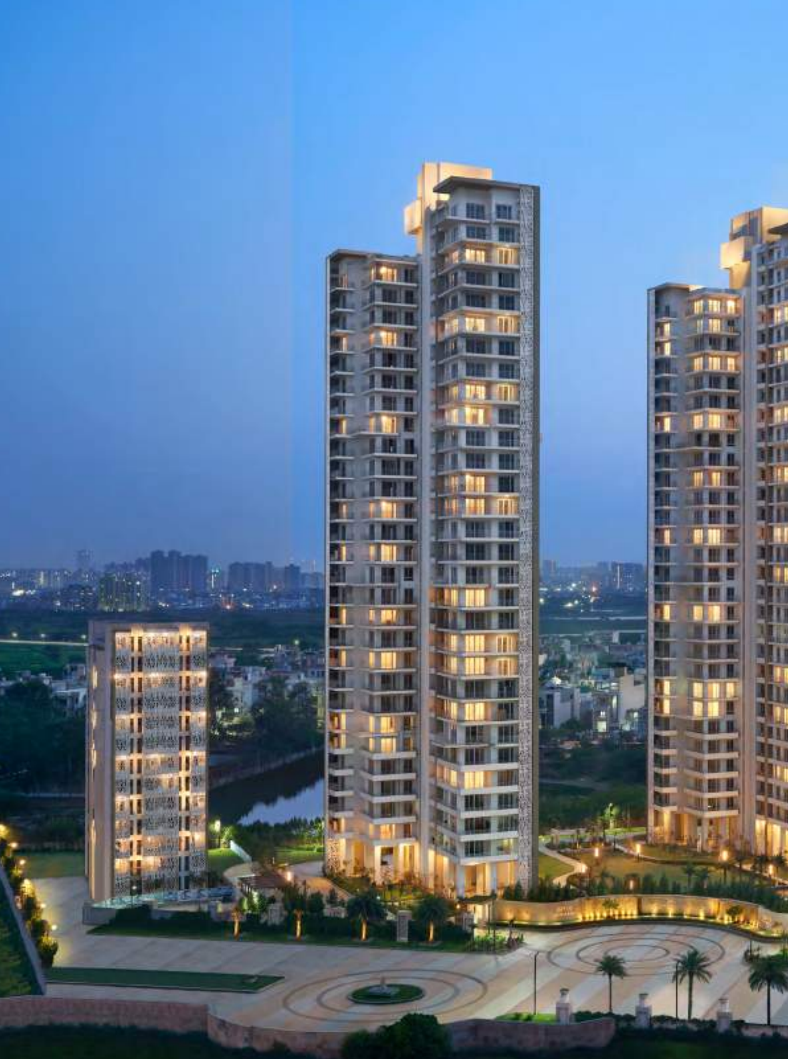
ACTUAL PICTURE OF EMERALD BAY, GURGAON