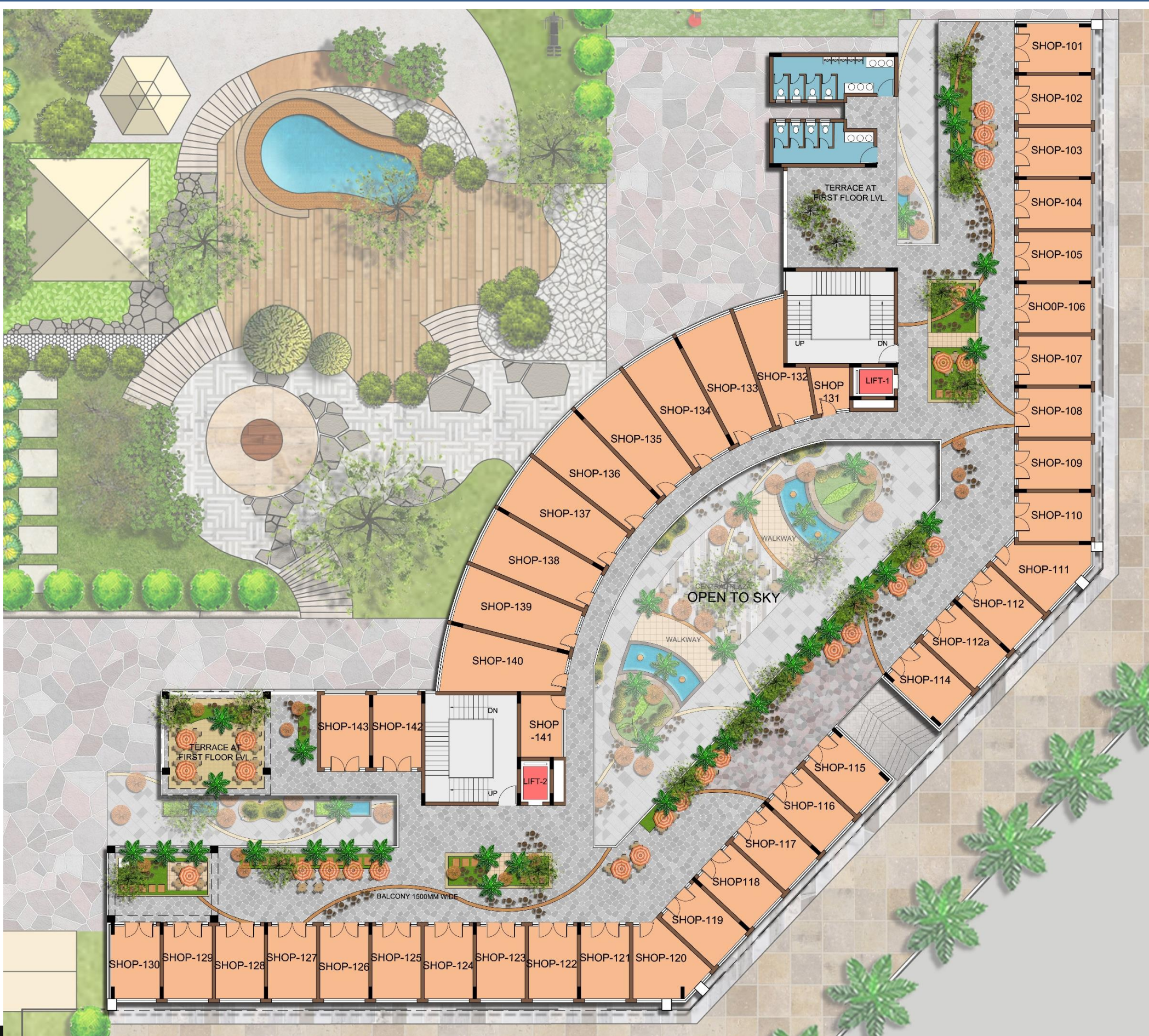
AUROVILLE PLAZA , AT SECTOR 103 , GURUGRAM All approvals in place