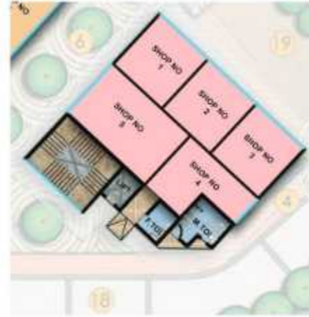
Sapphire Street Part 3 : Ground Floor