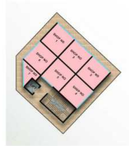
Sapphire Street Part 4 : Ground Floor