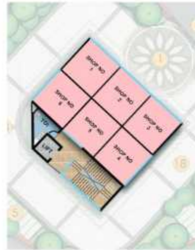
Sapphire Street Part 4 : Ground Floor