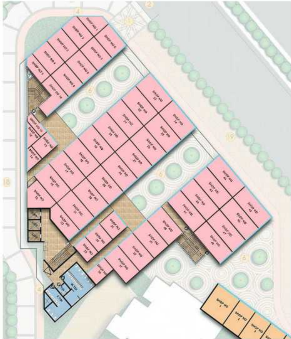
Sapphire Street Part 1 : Ground Floor