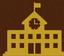
Provision for Pre-school & Nursing Home